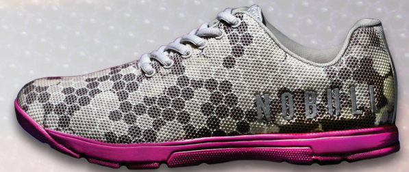
NOBULL Trainer with SuperFabric® MULTICOLOR